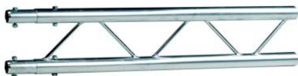
2 LD 1000